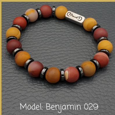
Model: Benjamin 029

"We design ..... You Combine ..... Your Wear ..... The Peniel Impresses ..... We Support"