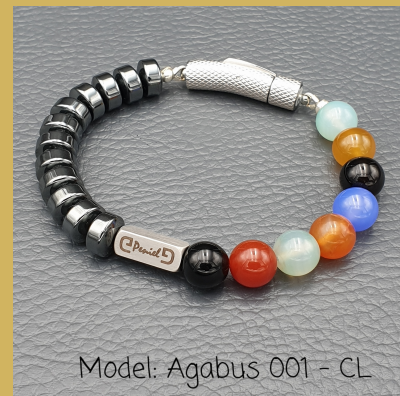
Model: Agabus 001 - CL